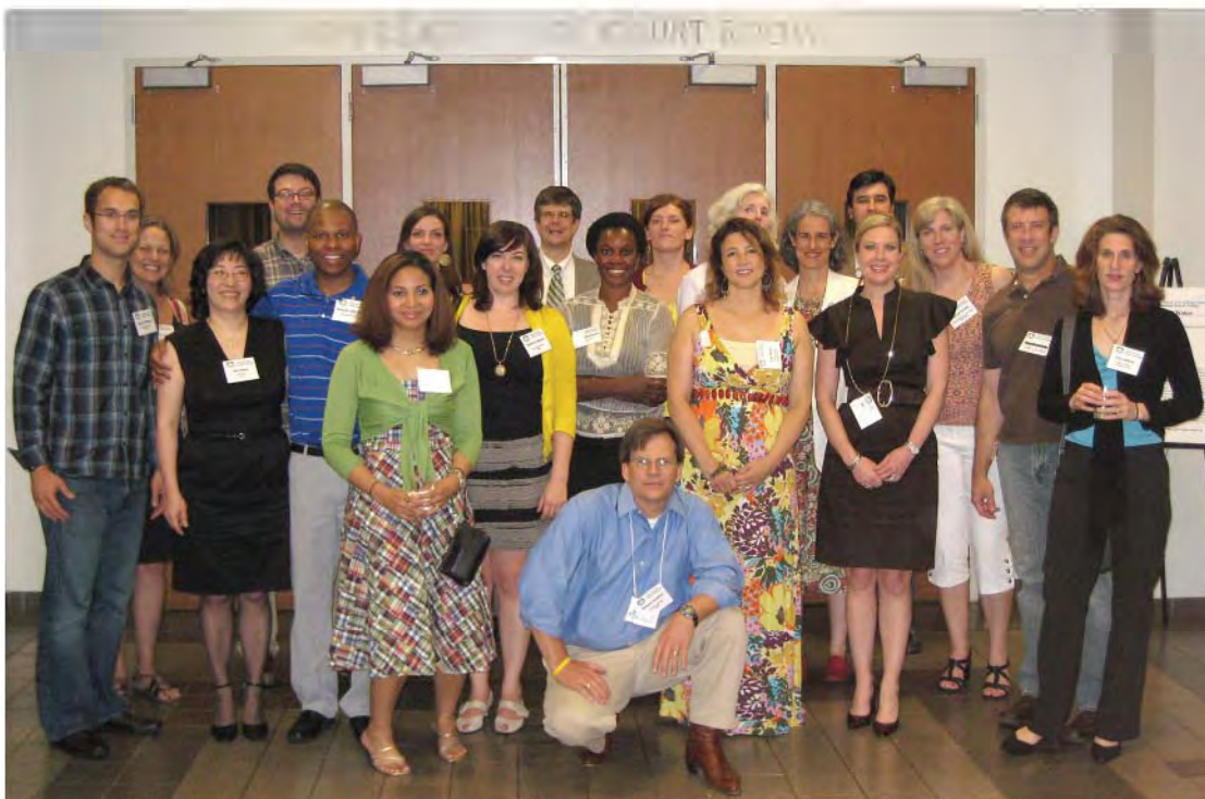
Staff, attorneys, and alumni celebrated at the Clinic's 20 th Anniversary Reunion.